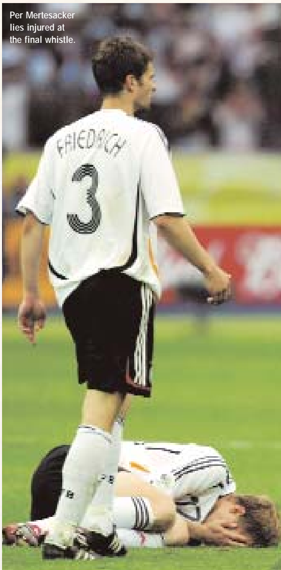
Per Mertesacker lies injured at the final whistle.

► had in other games. Ballack had much the same problem. Though he dropped deeper, there were still few players ever ahead of him for his to pass to. Needless to say, the first goal came from asset piece, Ayala losing his marker, Klose, and